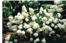
Little Lamb Hydrangea 18" bare root

This tough native shrub has straight stout stems once used to make arrows. Today it is valued for white spring flowers, striking glossy red fall color and bird-friendly black berries. It can tolerate a range of soils, including wet and dry and will grow in full sun to full shade. Remove suckers to keep it within a small area. It is a favorite of birds and butterflies. Mature height and width 6-15'. http://www.ag.ndsu.edu/trees/handbook/th-3-61.pdf