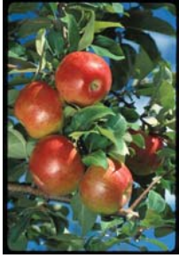
Honeycrisp Apple 5' bare root