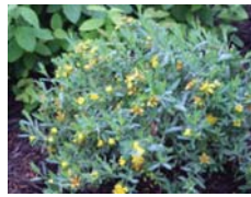
Blue Velvet Hypericum #1 container

Little Lamb is compact with huge flower panicles are comprised of tiny delicate florets that are tightly packed to form a spectacular white flower regardless of PH. Prefers moist, well-drained soil in full sun or partial shade. It yields excellent cut flowers over a long season and flowers can be dried. Mature height and spread 6-8'. http://www.colorchoiceplants.com/little_lamb.htm