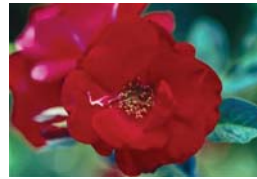
Hope for Humanity shrub rose #2 container

Attractive rounded lilac that blooms later than most lilacs. Its leaves are larger and have a unique shape. Resists fall mildew. Flower panicles are huge and the truest pink of any lilac. Very photogenic. Mature height 6-9'. http://www.cornhillnursery.com/retail/shrub/lmisscanada.html