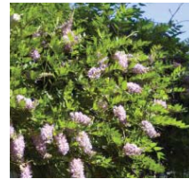
Wisteria Aunt Dee 2 yr. 1 gal. container

Double dark red ever-blooming rose will be in full bloom when you pick it up! The lustrous foliage has good disease resistance. Needs no winter protection but will require some spring pruning. Apply a time release fertilizer for spectacular results. Mature height and spread 2-4'. http://www.canadianrosesociety.org/index.php?option=com_content&view=article&id=90&Itemid=55