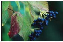
Arrowwood Viburnum 2' bare root