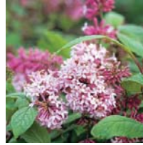
Miss Canada Lilac 12" bare root

A low mounded shrub with attractive blue velvet aromatic leaves that fill the garden with their beautiful scent. Covered with golden-yellow flowers from June through September, its late season display of bright red berries make it a autumn delight. Low maintenance and prefers full sun to light shade. Can be used as a specimen, hedge, or in mass planting. Mature height and spread 2-3'. http://www.greenwoodnursery.com/page.cfm/47364